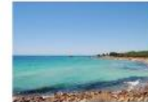
New looking out board @ Sunset Point