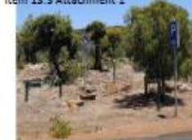
Multiple signs to be consolidated into one comprehensive sign (3, or park)

Council 11/12/2013 Item 13.3 Attachment 1