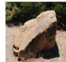
Use of local materials found as vehicle barriers