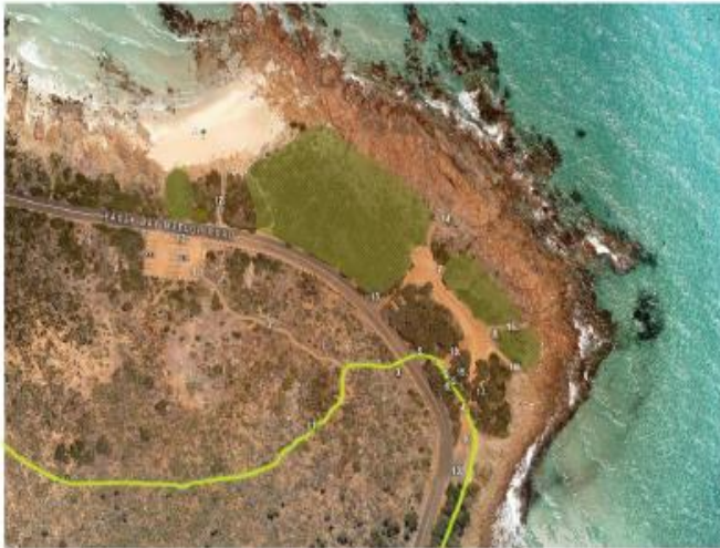
POINT PICQUET CONCEPT PLAN 1:1000