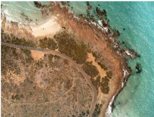
EXISTING CONDITION 1:500