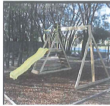
ACTIVE PLAY AREA