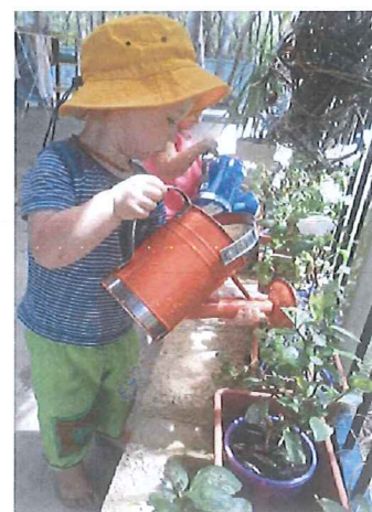
QUIET NATURE PLAY ACTIVITY