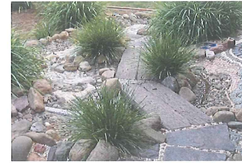
DRY CREEK BED