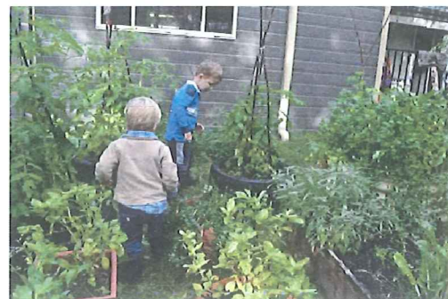
QUIET NATURE PLAY ACTIVITY