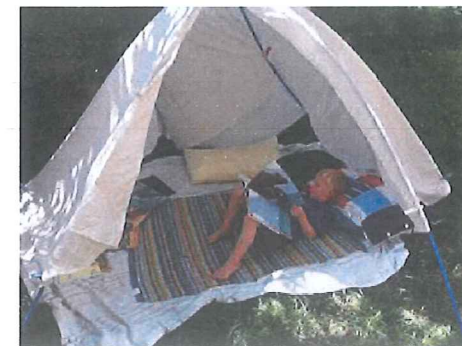
QUIET NATURE PLAY ACTIVITY