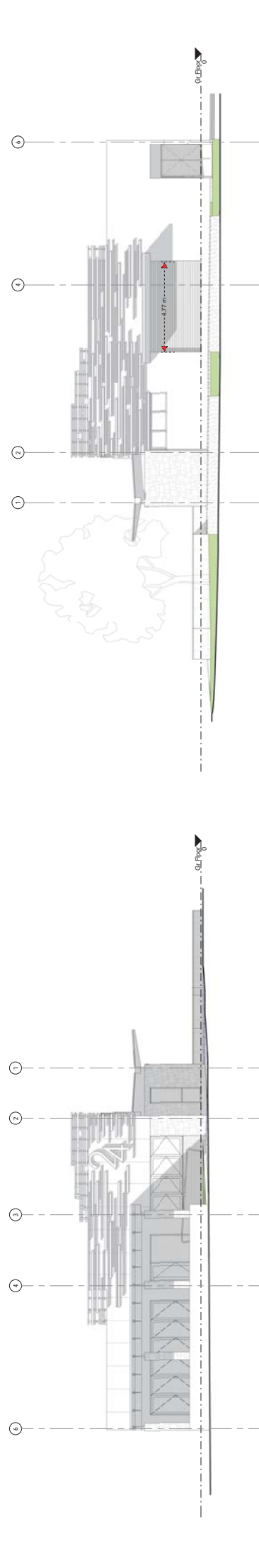
2 ELEVATION SK.07 Scale 1:100 @ A1